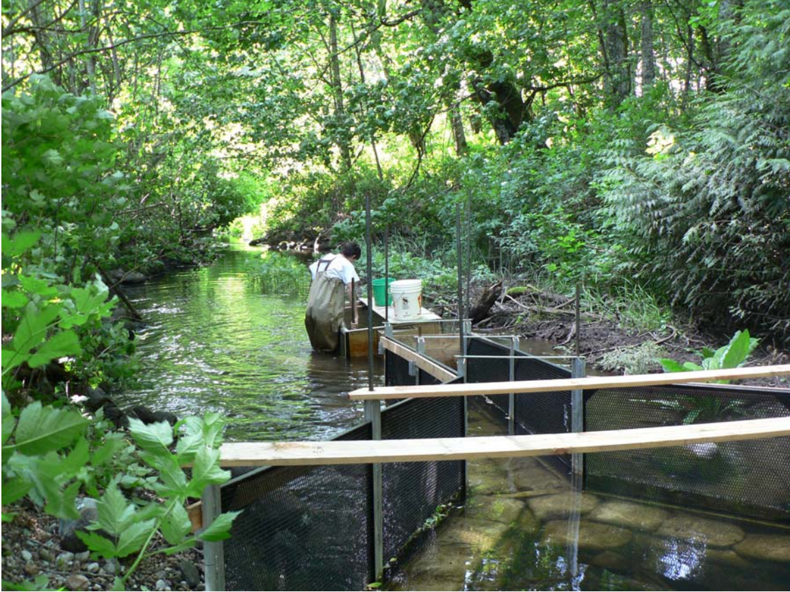
Figure 1. New trap installed 50m upstream of Government Road on Meighan Creek in Spring 2006