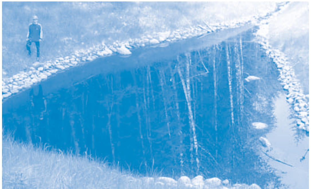
The image above is just one example of a project undertaken by Hecate Strait Streamkeepers. This photo shows the stabilization of banks and the creation of riffles and pools for spawning.

Continue mainstem restoration activities that commenced in Spring 2002 on the Little Qualicum River. Large woody debris will be constructed to improve Steelhead juvenile rearing and adult holding capacity; prescriptions to improve tributary access and re-establish several off-channel alcoves to increase over-wintering areas.