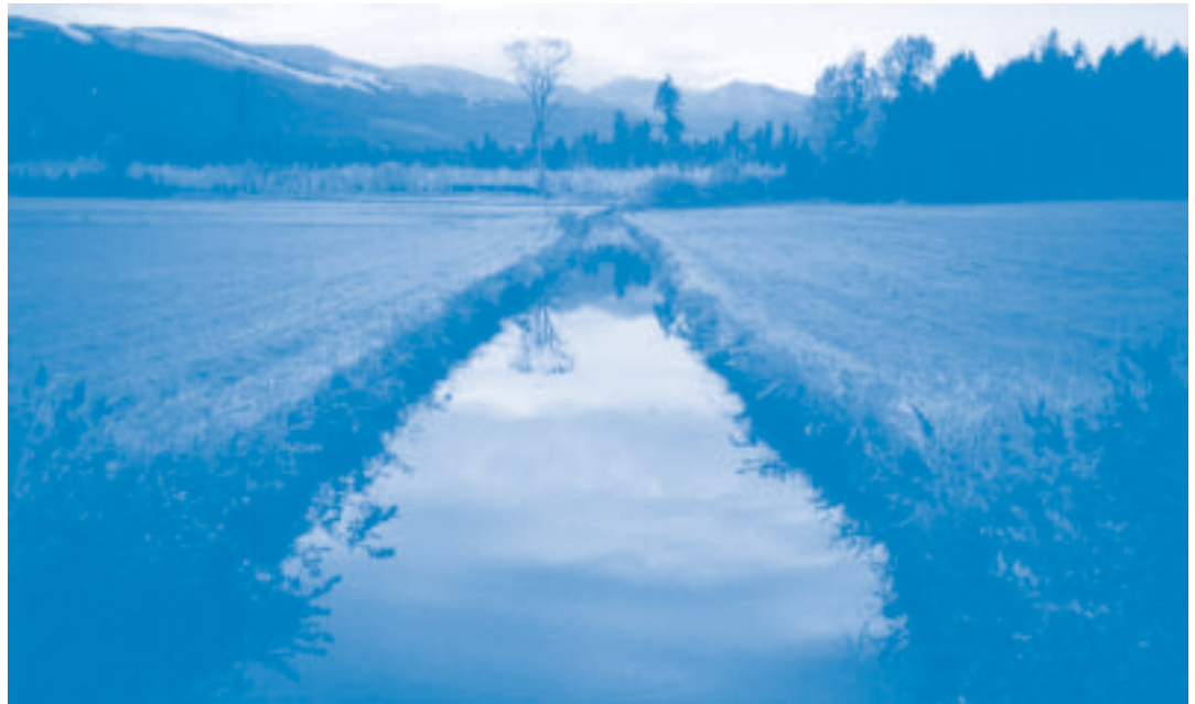
The Englishman River, located in the mid-east area of Vancouver Island at Parksville, is part of the first watershed to receive attention from PSEFS.

The Englishman River was selected by the PSEFS as the first watershed to receive attention in the Georgia Basin salmon recovery planning process for salmon in 2001. The Englishman River is located in the mid-east area of Vancouver Island at Parksville and is an important salmon-producing stream on the mid-coast of Vancouver Island. The Recovery Plan for the Englishman was completed in September 2001. A