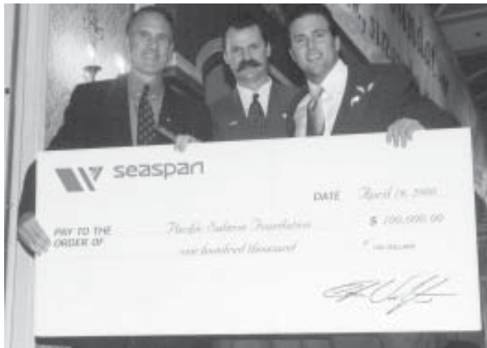
Washington Marine Group's contribution of $100,000 was key to the success of the Stuart Island Initiative.

Pacific Salmon Foundation is pleased to announce an initial 5-year Partnership Agreement with TimberWest Forest Corp. This partnership will be to manage a program funded by TimberWest to develop and support salmon habitat restoration and enhancement activities on TimberWest's private lands. TimberWest is committed to spending $300,000 over 5 years on joint projects, which are to be selected by consensus between both parties. For 2002, approximately $30,000 has been allocated to conduct work on Pyrrhotite Creek (a tributary to the Tsolum River), for the Lower Wetlands Passive Treatment for Copper Reducation project.